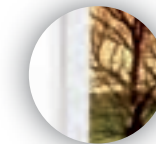
Image to the edge with white sides